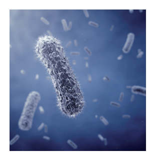
Laboratory certified 99.999% bacteria-free Every Borg & Overström appliance undergoes an anti-microbial, antipathogen, sanitising procedure. The reassurance of hygienically safe appliances is provided by the unique bacteria-eliminating process, Sterizen<sup>™</sup>.